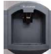
Easy Push Chute