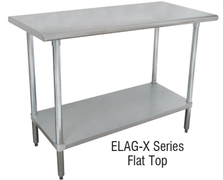
ELAG-X Series Flat Top