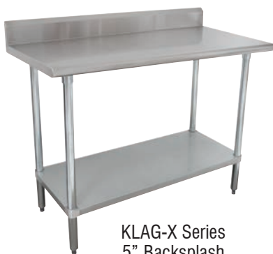
KLAG-X Series 5" Backsplash