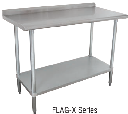
FLAG-X Series 1 1/2" Backsplash