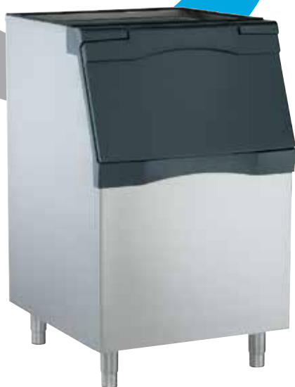
B530S show with optional KLP8S legs.