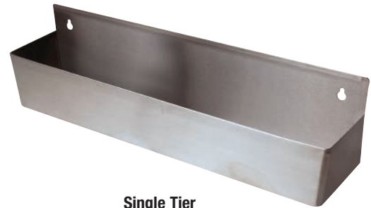
Single Tier BK-2 Shown