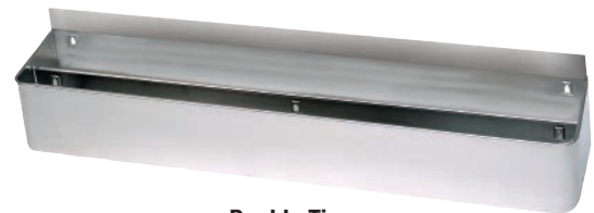
Double Tier DT-4 Shown